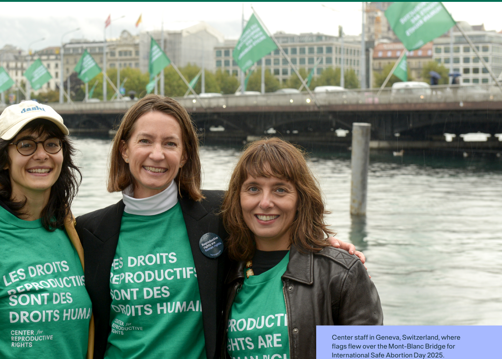
Center staff in Geneva, Switzerland, where flags flew over the Mont-Blanc Bridge for International Safe Abortion Day 2025.