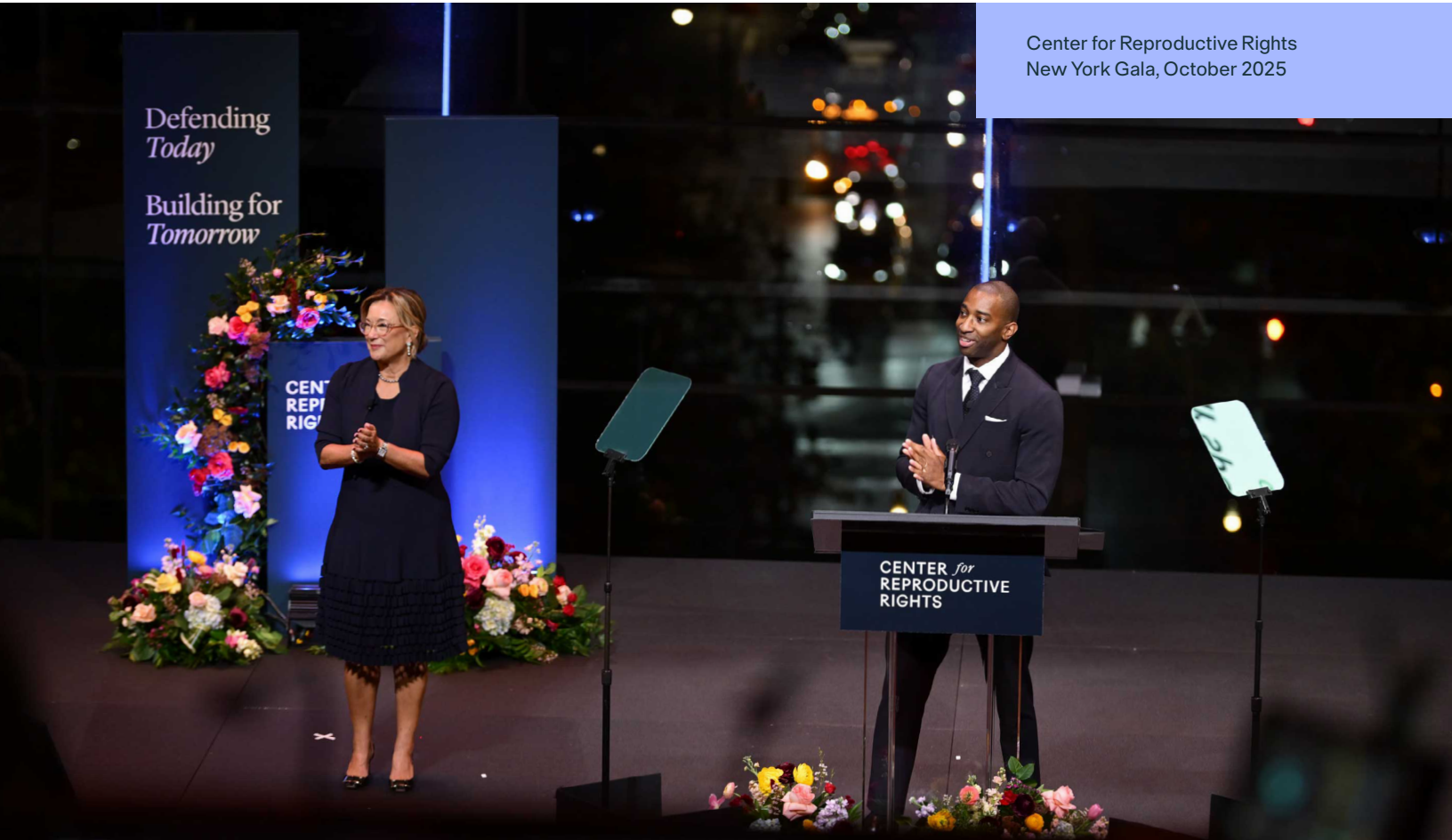
Center for Reproductive Rights New York Gala, October 2025