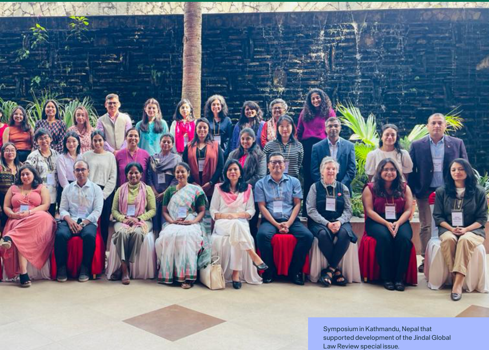
Symposium in Kathmandu, Nepal that supported development of the Jindal Global Law Review special issue.