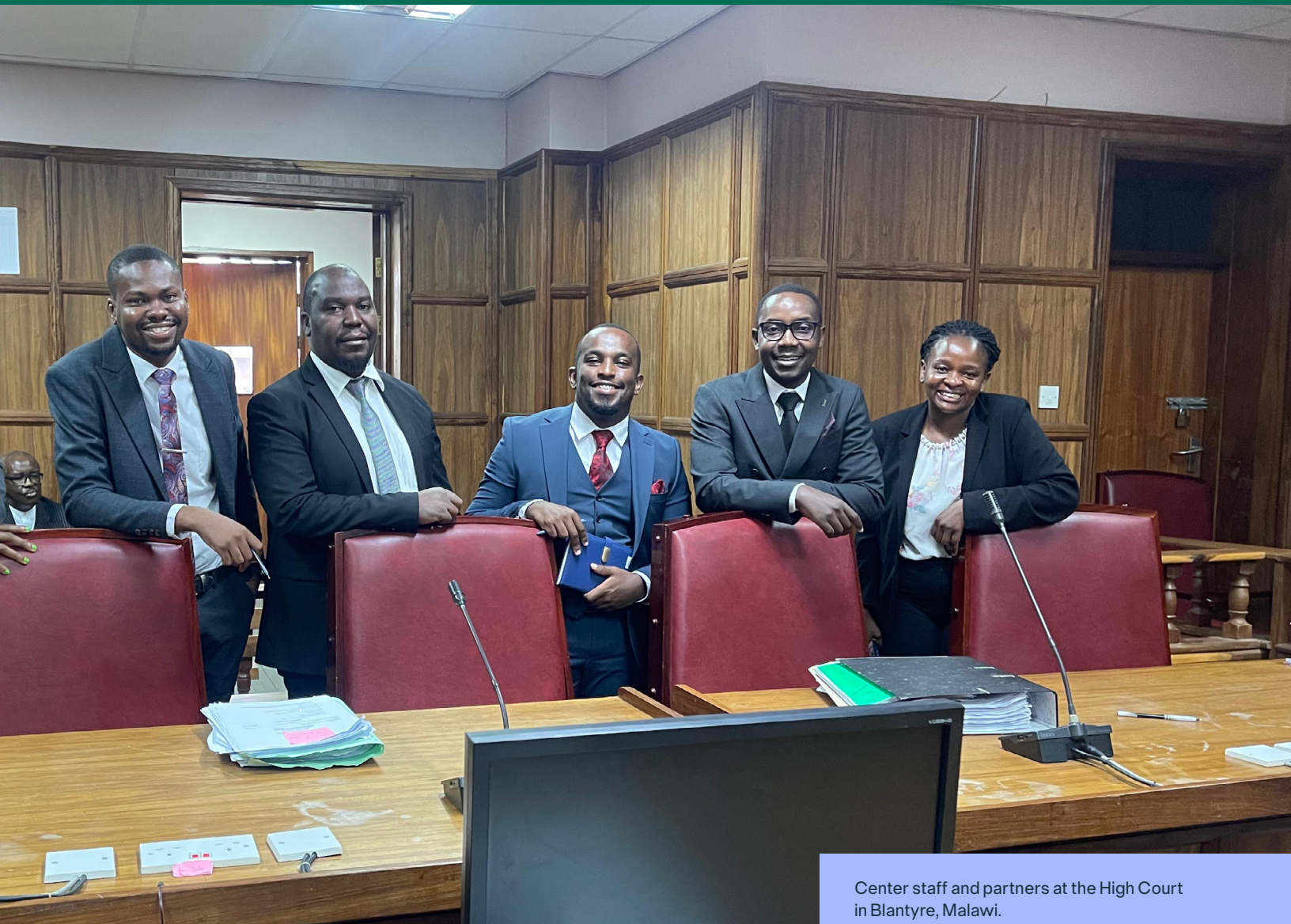
Center staff and partners at the High Court in Blantyre, Malawi.