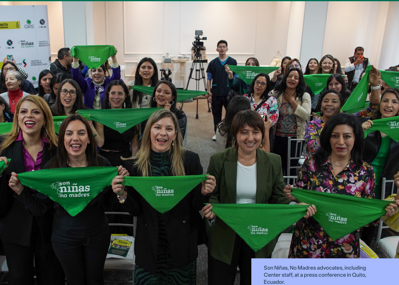
Son Niñas, No Madres advocates, including Center staff, at a press conference in Quito, Ecuador.