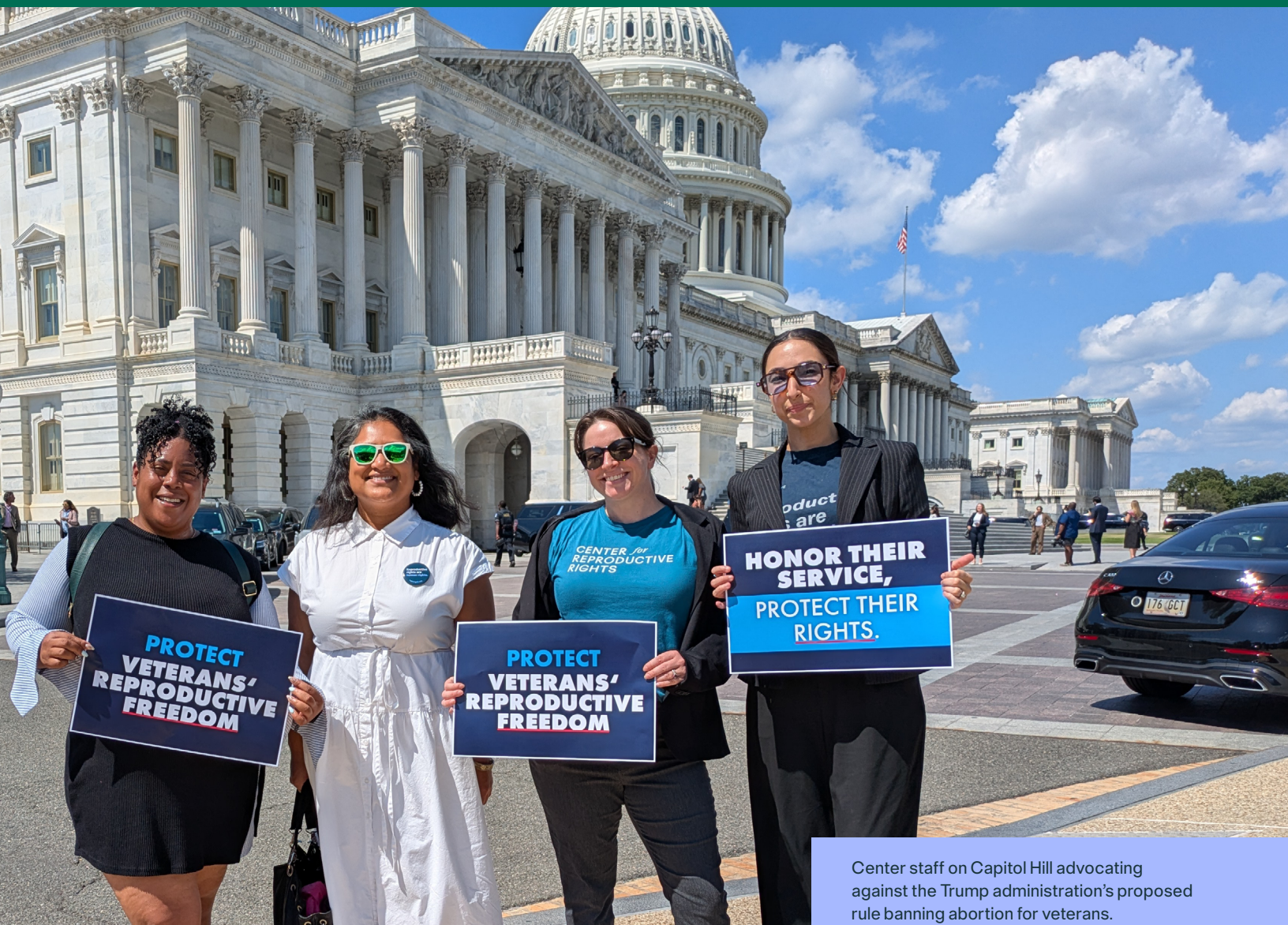
Center staff on Capitol Hill advocating against the Trump administration's proposed rule banning abortion for veterans.

“ Even in this crisis moment, we can and we must build toward the world we want to live in. The wins are possible and we’re seizing them all.”