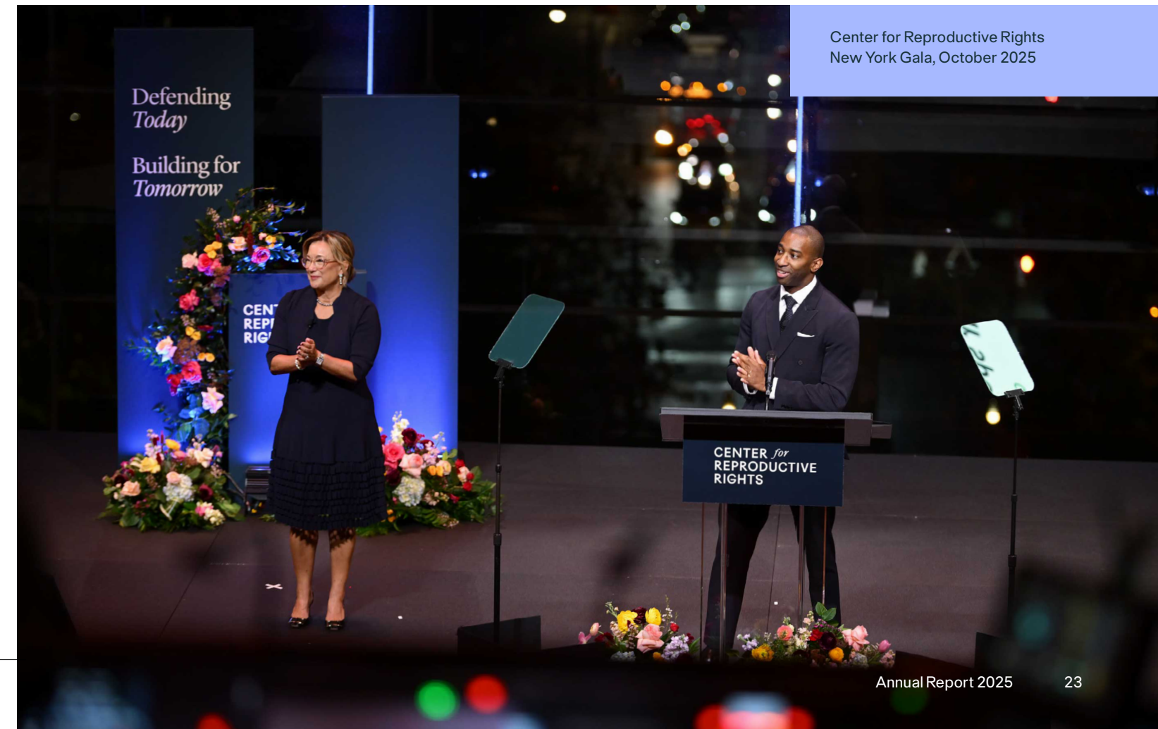
Center for Reproductive Rights New York Gala, October 2025