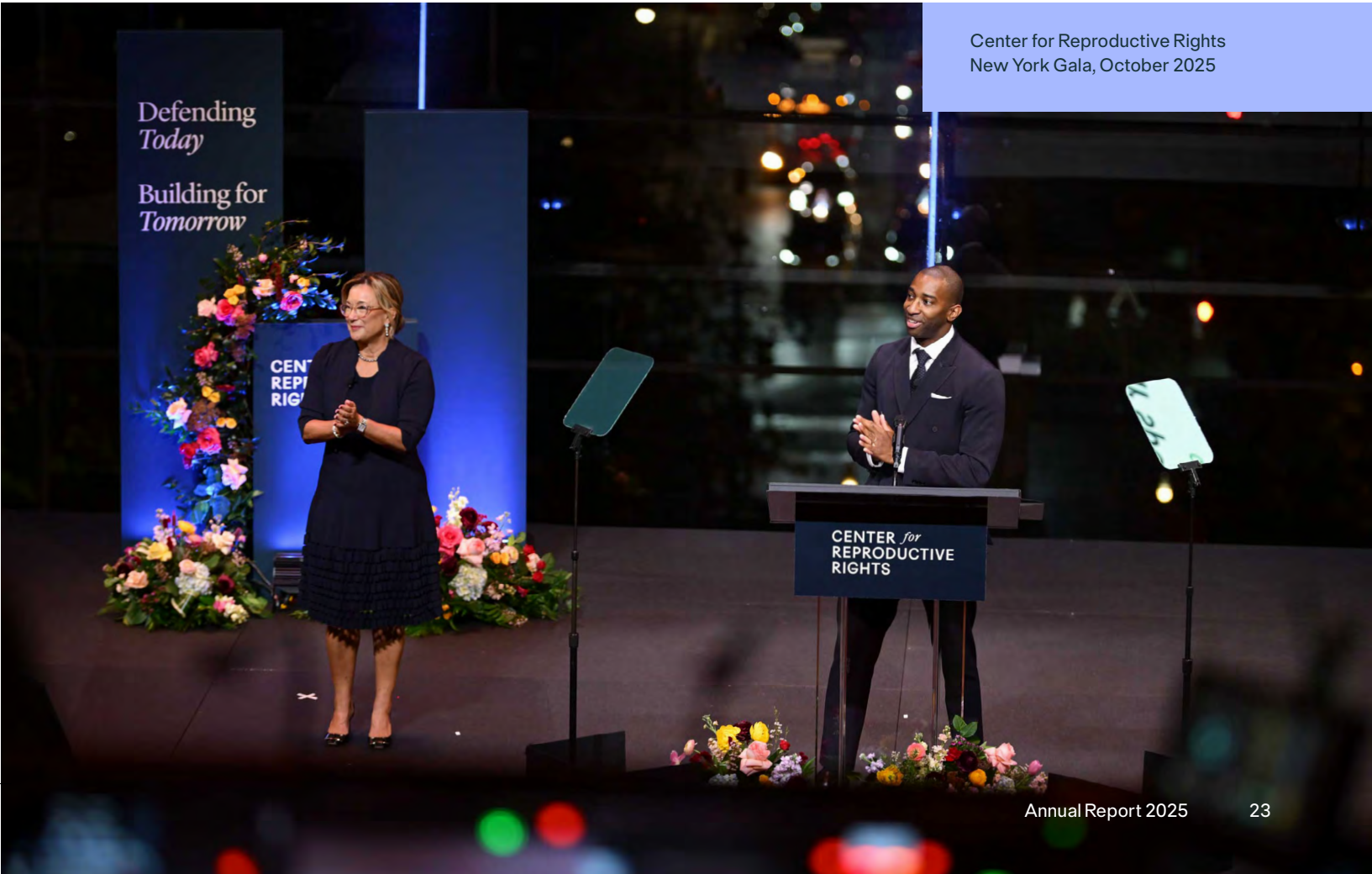
Center for Reproductive Rights New York Gala, October 2025