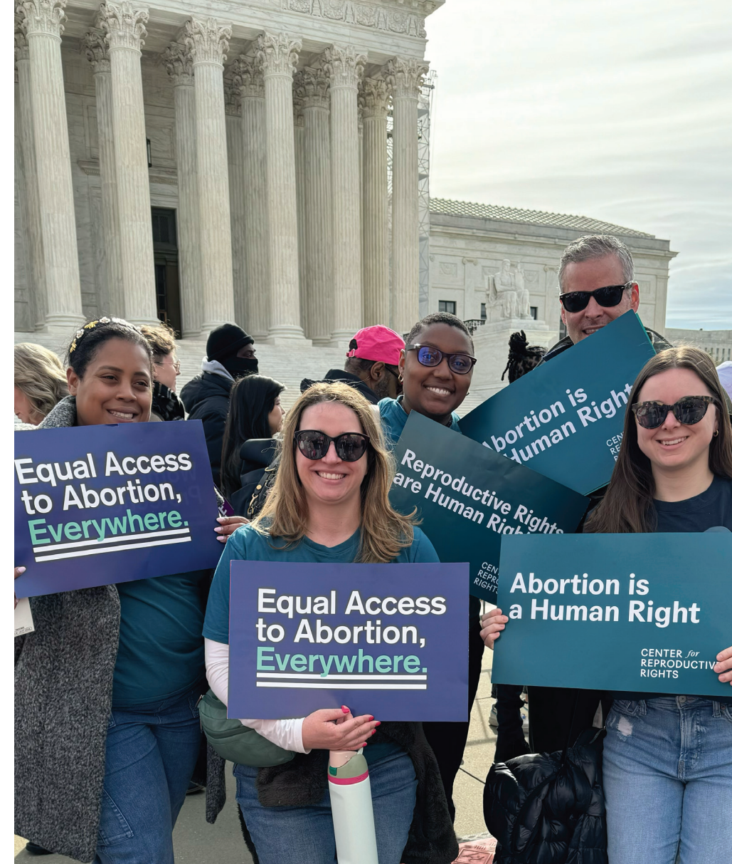
Center staff outside the U.S. Supreme Court.

We have filed lawsuits on behalf of more than 30 women across the country who were denied abortion care despite dangerous pregnancy complications, and we supported our clients to bravely share their stories in court, at congressional hearings and meetings, before the Inter-American Commission on Human Rights, at the State of the Union address, and in high-profile press coverage. Their determined fight has helped to shift the national conversation on abortion rights.