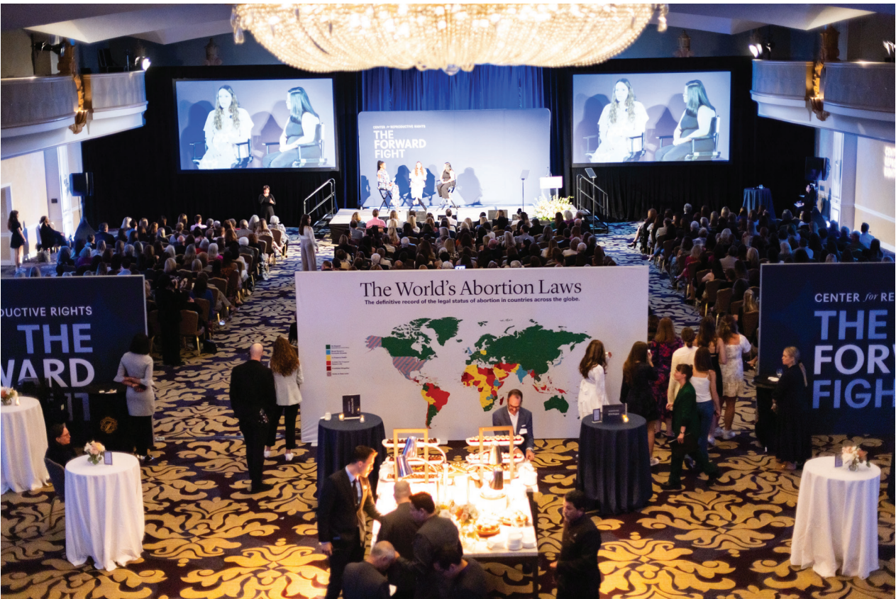
Center for Reproductive Rights San Francisco Benefit, May 2024.

You can also email us at: contribute@reprorights.org