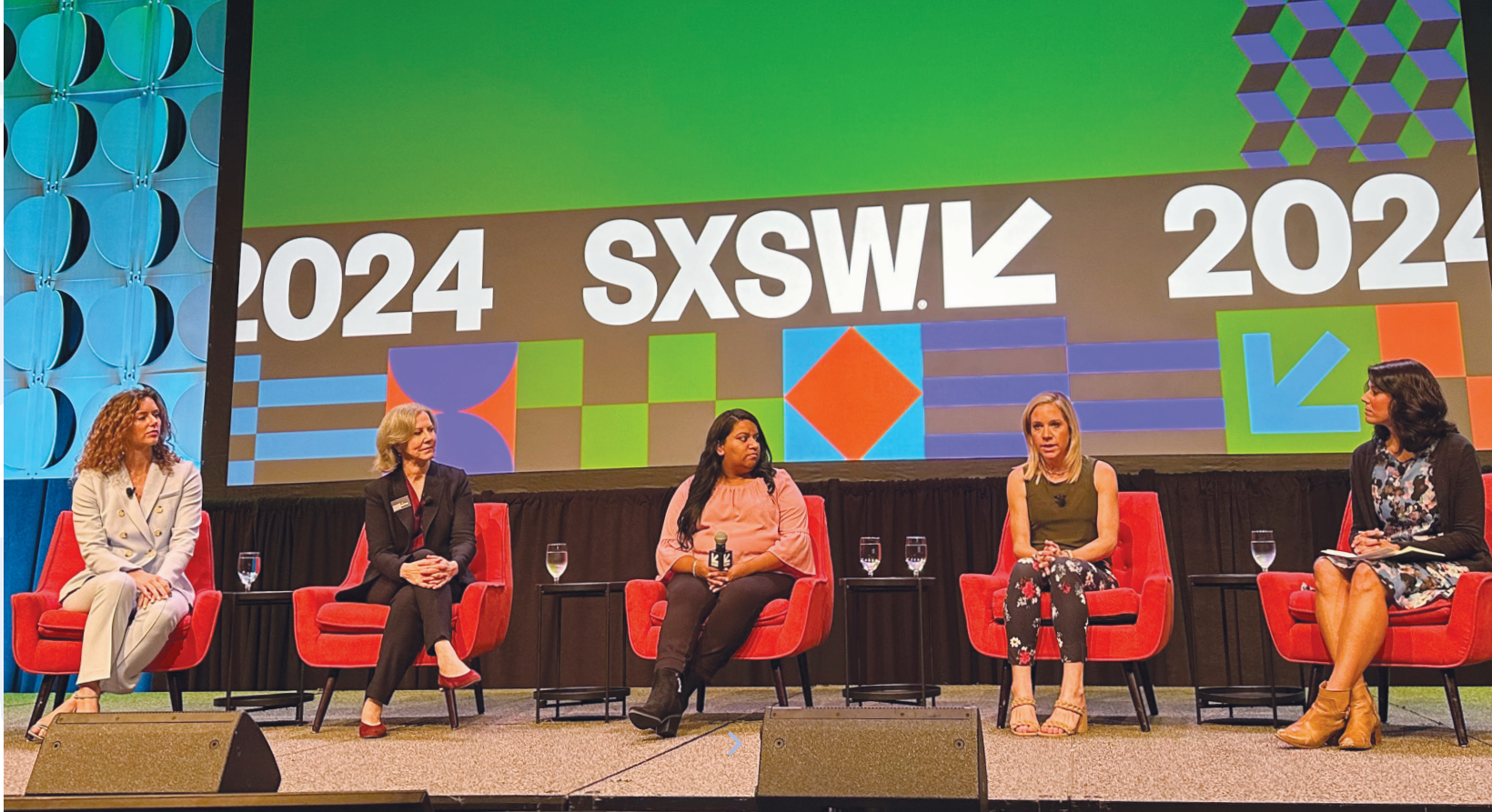
Panel discussion featuring Center plaintiffs and corporate partners, “Health Care Crisis in Post-Roe America: Finding Your Voice,” at the SXSW Conference in Austin, Texas, March 2024.