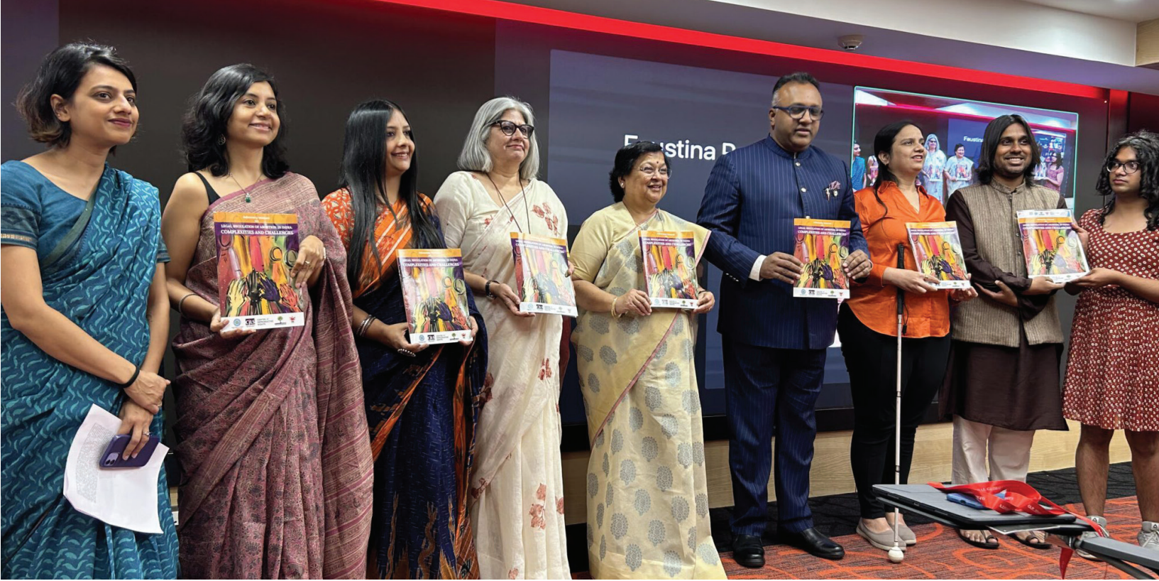
Center staff, partners, judges, and other legal and human rights experts in New Delhi to launch an advocacy manual on India’s abortion laws.

Following its review of India , the UN Human Rights Committee recommended that the government address barriers to safe abortion access, eradicate forced sterilization practices, and provide access to reproductive health education and services. We have been a driving force for reproductive rights law and policy reform in India for years, and we will leverage these strong recommendations in our ongoing advocacy.