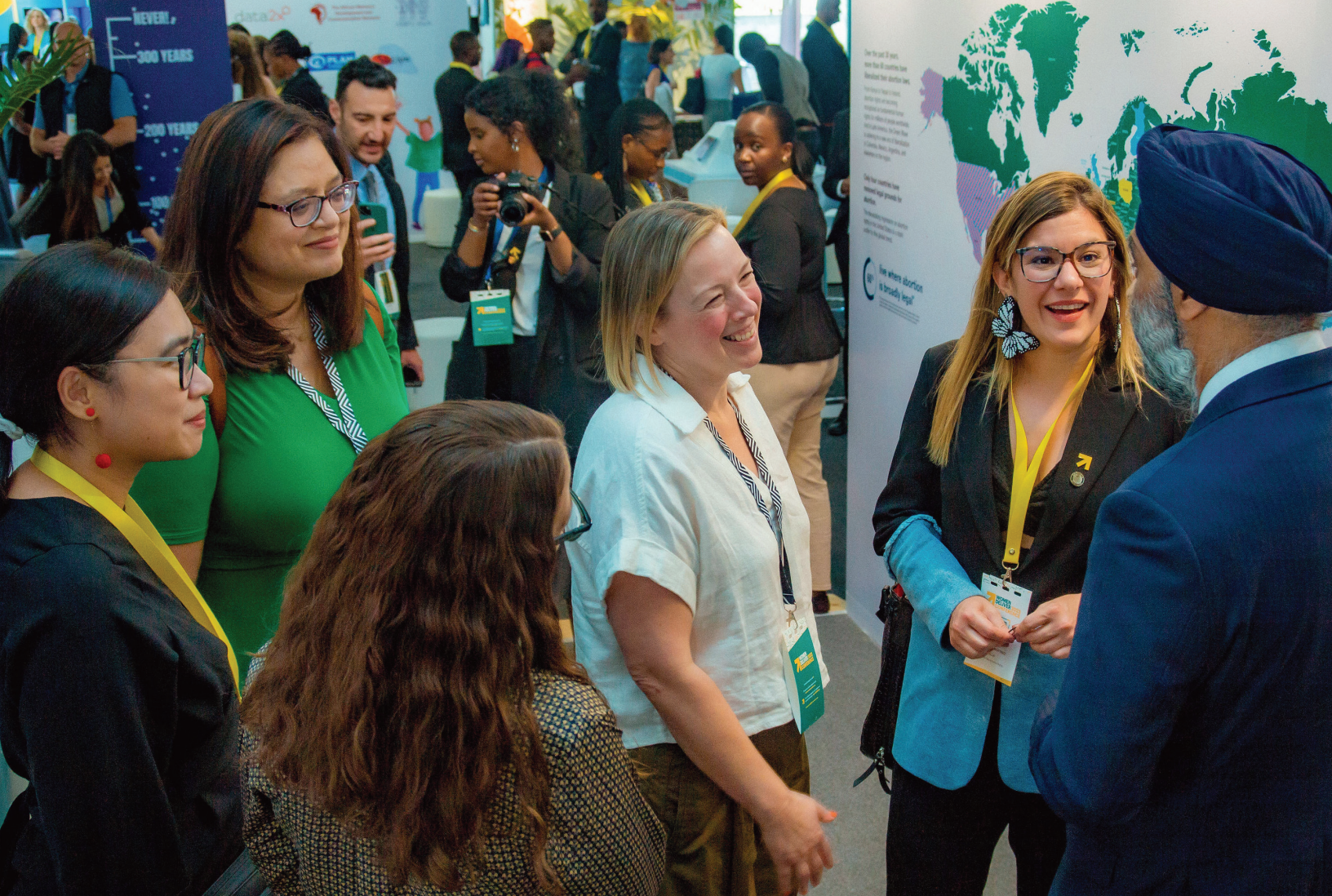
Center staff speaking with Canada's Minister of International Development, Harjit S. Sajjan, in front of our World's Abortion Laws map at the Women Deliver 2023 conference in Kigali, Rwanda.

“The contemporary and progressive understanding of human rights is more deeply protected in law and policy than even before, despite how loud the anti-rights voices are becoming, but we might be at a tipping point.”