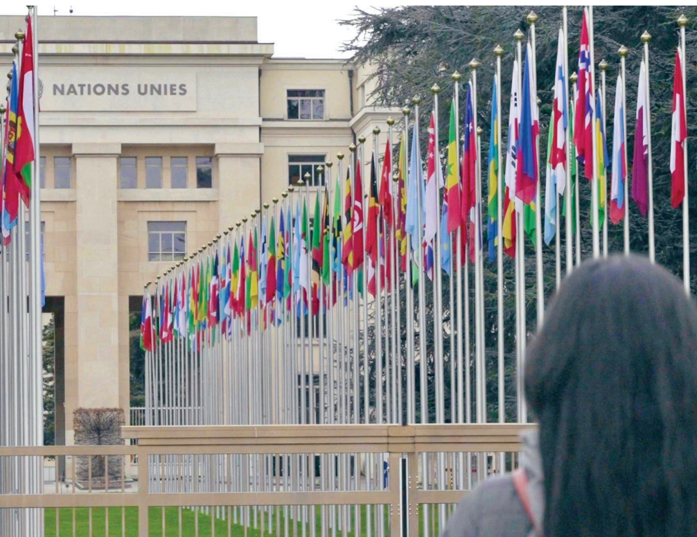
Center client Fausia at UN Headquarters in Geneva in April 2024.