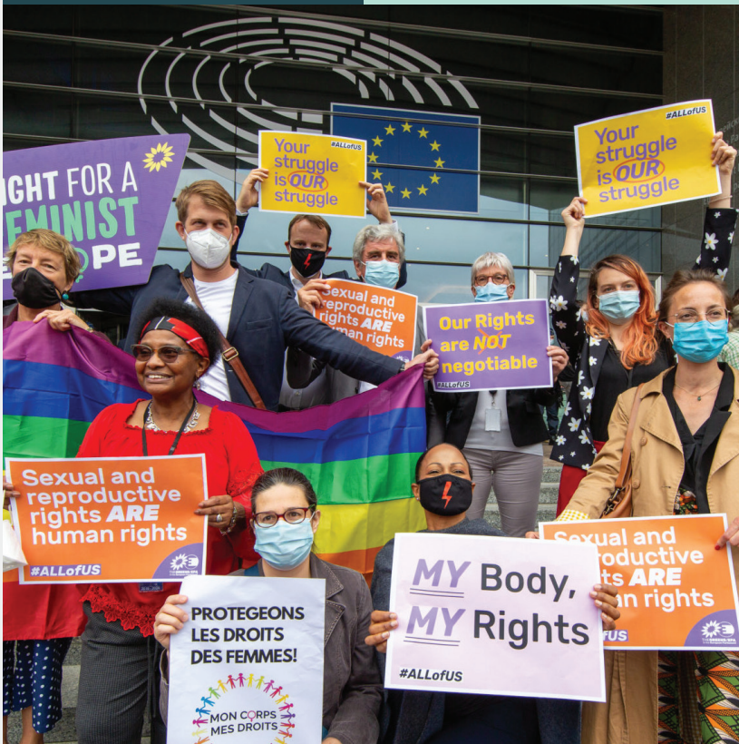
Action in support of SRHR by members of the European Parliament in front of the European Parliament.

We work with a broad group of stakeholders to promote SRHR across the region, and we provided resources and support to members of the European Parliament leading on this initiative. The adopted resolution cites our World Abortion Laws Map in its discussion of laws on abortion globally and in the EU that still fall short and fail to protect reproductive rights.