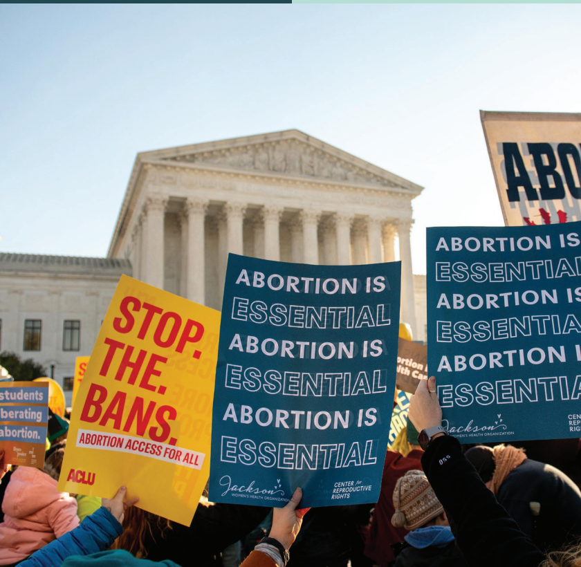
Abortion rights supporters outside the U.S. Supreme Court.

Senior Director of U.S. Litigation, Center for Reproductive Rights, arguing before the U.S. Supreme Court in our Mississippi case, Dobbs v. Jackson Women’s Health Organization