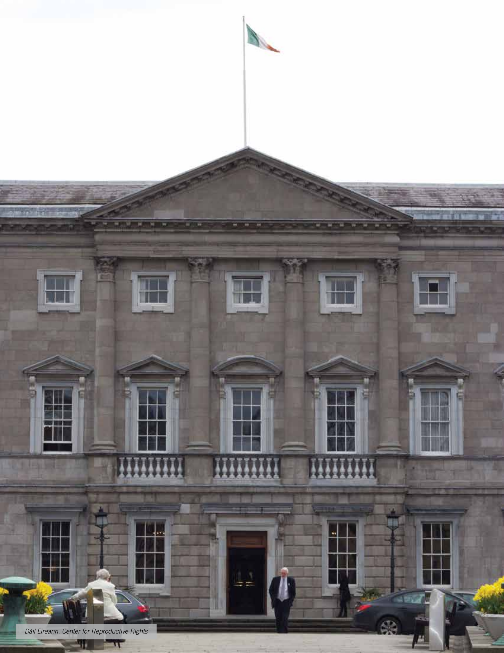
Dáil Éireann. Center for Reproductive Rights