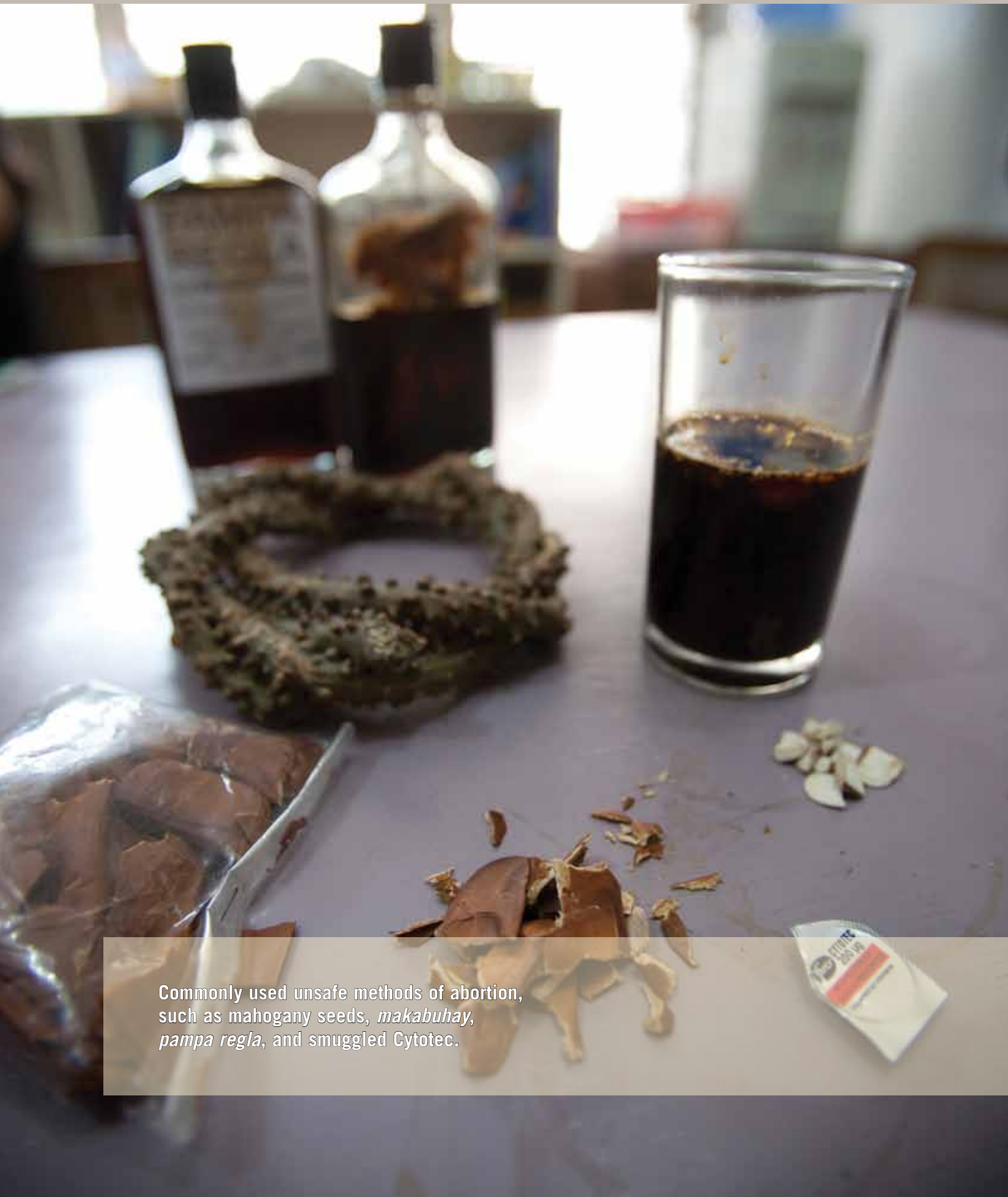
Commonly used unsafe methods of abortion, such as mahogany seeds, makabuhay , pampa regla , and smuggled Cytotec.