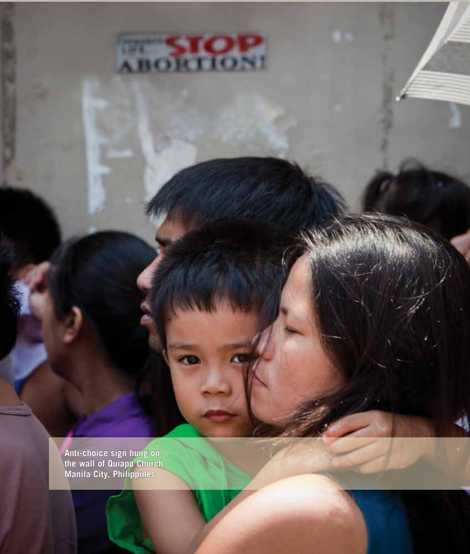
Anti-choice sign hung on the wall of Quiapo Church Manila City, Philippines

entrusted with administering post-abortion care are not consistently given the training and equipment needed to do so effectively. Many of the providers interviewed for this report pointed to the lack of government investment in post-abortion care services as a major cause of the poor quality of services.