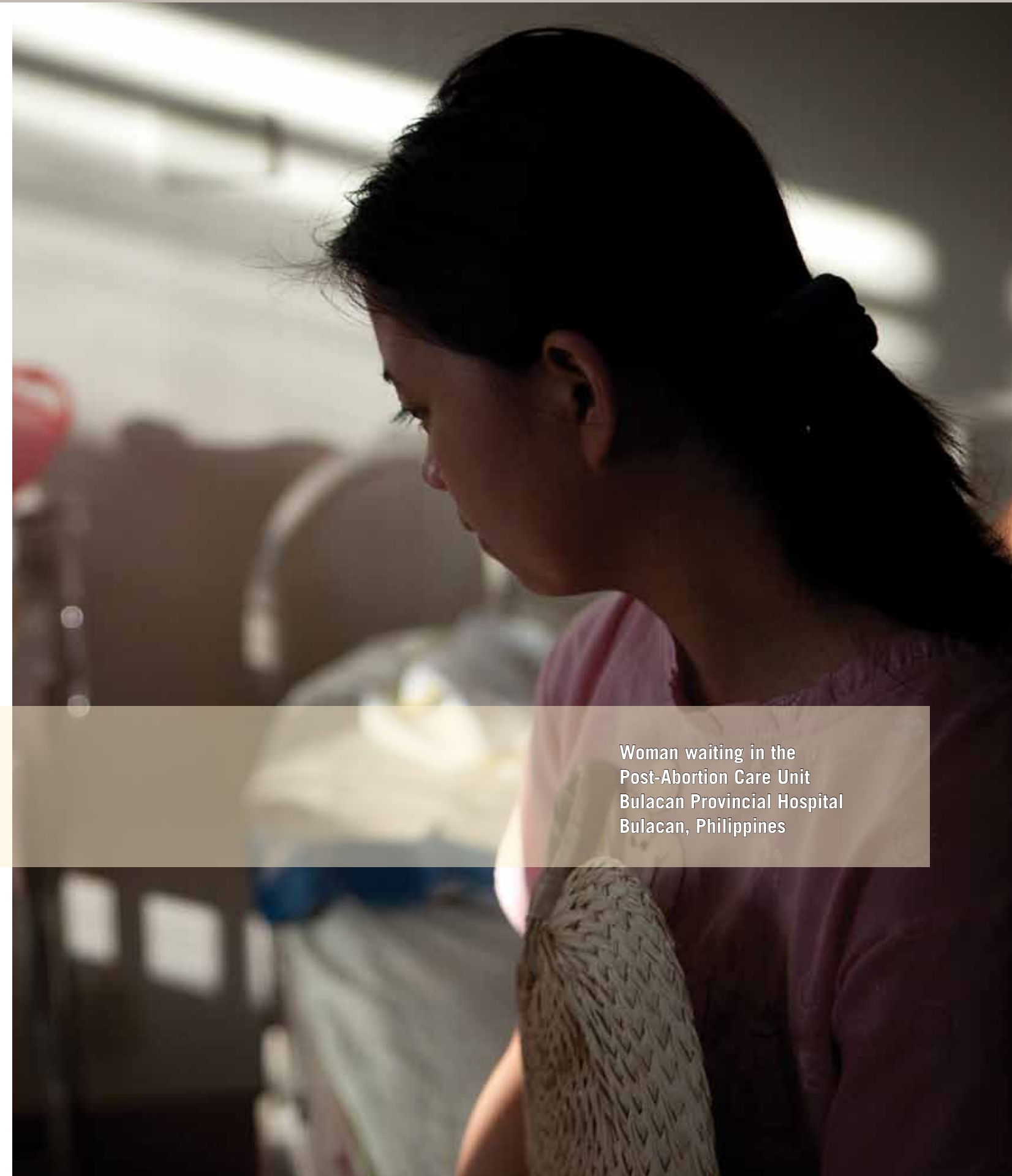
Woman waiting in the Post-Abortion Care Unit Bulacan Provincial Hospital Bulacan, Philippines

The government of the Philippines must decide whether it will allow women to seek terminations safely without risking death, disability, and discrimination or whether it will continue to unfairly outlaw and penalize a medical procedure that is widely recognized as an essential component of women's healthcare and a human right.