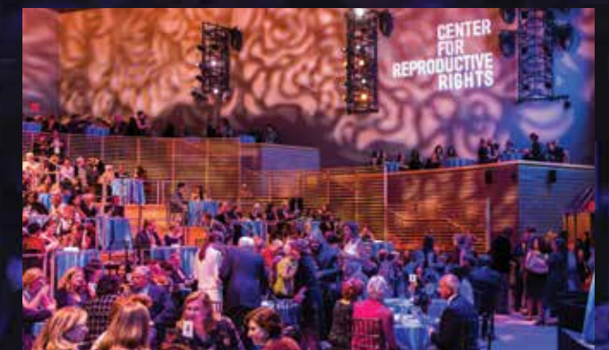
Guests waiting for the program to begin