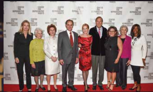
Members of the Center's Board